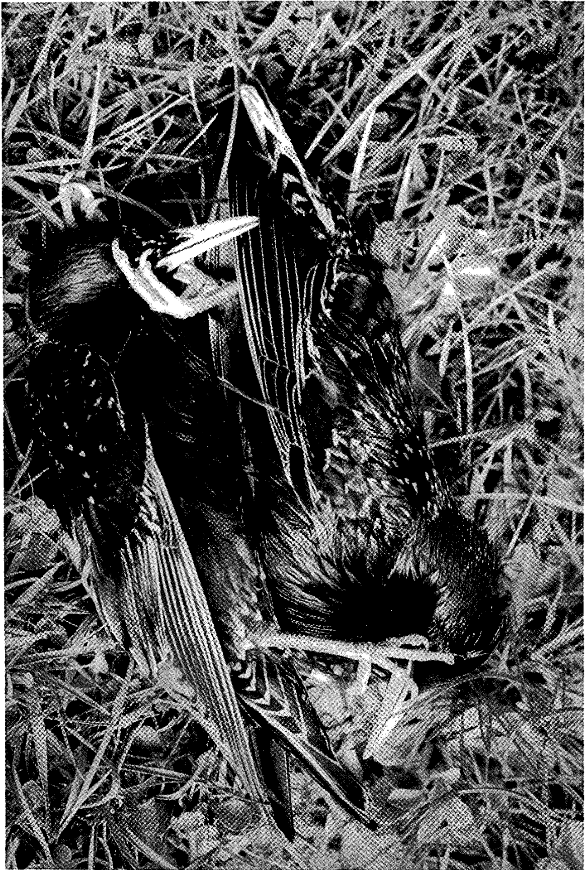
FIGURE 1 — Two adult male Starlings found dead in a nest box, 20 October 1986, with claws penetrating each other's eyes