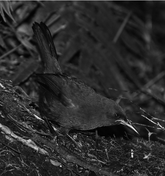
Fig. 3. Juvenile South Island saddleback, Anchor Island, Mar 2011. The South Island saddleback has been successfully translocated to more sites than any other New Zealand bird taxon (18 sites, with 5 more in progress), and would be extinct had it not been rescued by translocation in 1964.

young to reinforce wild populations is extensively used in conservation programmes for 4 kiwi taxa, blue duck, takahe and black stilt (Maloney & Murray 2000; Eason & Willans 2001; Colbourne et al. 2005; Young 2006; van Heezik et al. 2009).