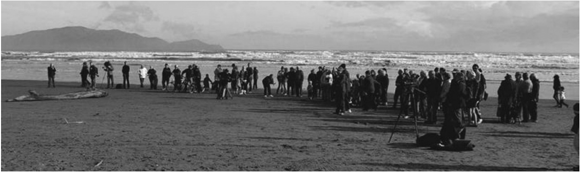
Fig. 2. Crowd gathered to view the emperor penguin at Peka Peka Beach, 24 Jun 2011.

main focus of the care programme was to protect the penguin from over-enthusiastic admirers, with a cordon maintained around the bird (initially 5 m, later 50 m) and to ensure that it always had access to the sea.