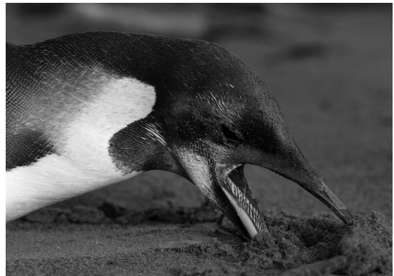
Fig. 3. The emperor penguin eating sand at Peka Peka Beach, 24 Jun 2011.

Soon after arrival, the penguin was anaesthetised and x-rayed, revealing a large mass of sand in its oesophagus and proventriculus (Fig. 4). Most of the sand was in its proventriculus required further