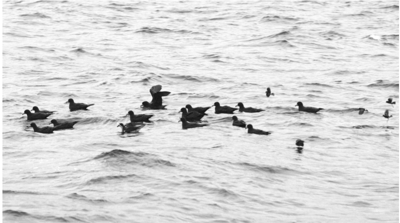
Fig. 2. Raft of black petrels with 1 Galapagos petrel and 5 white-vented storm-petrels.

white-vented storm petrels and other taxa actively foraging in this area.